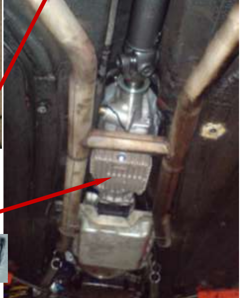
Overdrive unit mounted on rear of T700