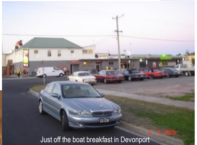
Just off the boat breakfast in Devonport