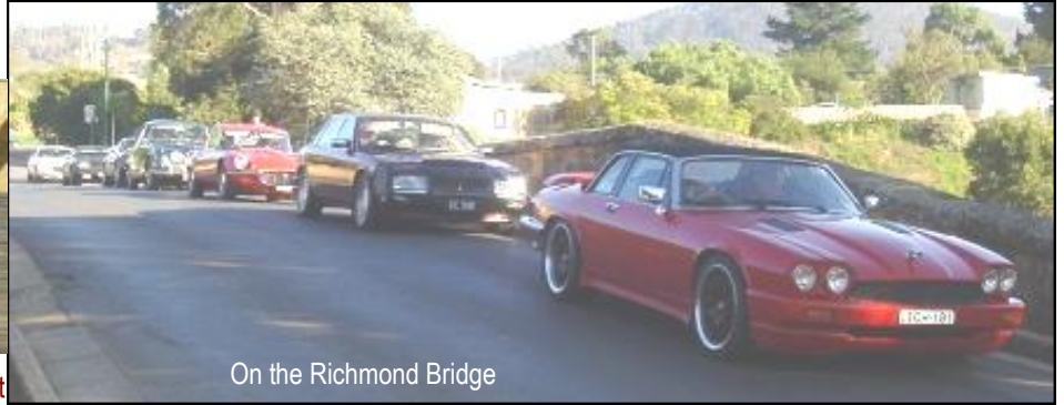
On the Richmond Bridge