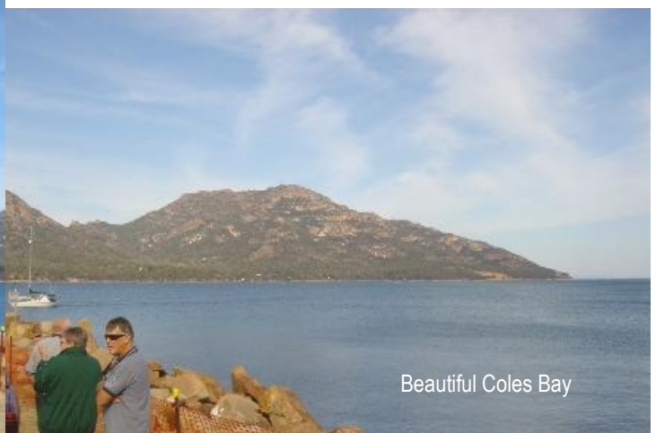
Beautiful Coles Bay

We then drove on to Swansea (nice little town) then Coles Bay where we stayed for lunch then followed the coast road to Bicheno, Four Mile Creek and Falmouth and had an ice cream stop at Scamander then onto St Helens