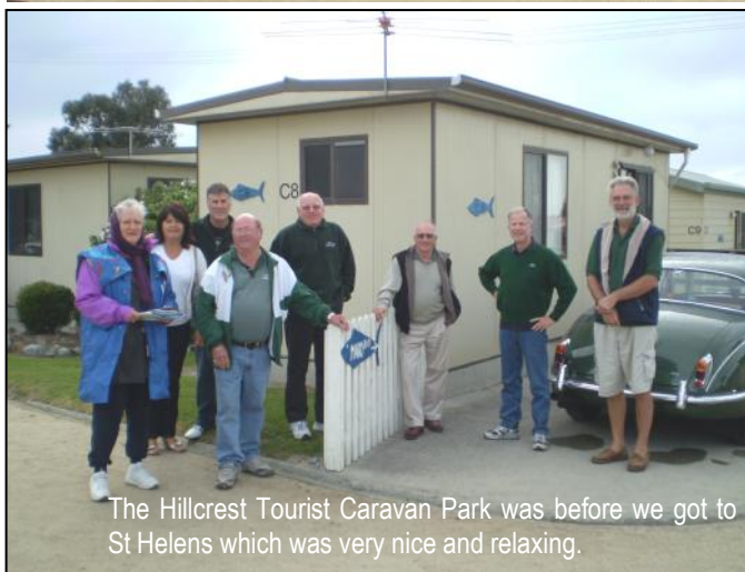
The Hillcrest Tourist Caravan Park was before we got to St Helens which was very nice and relaxing.

We then drove on to Swansea (nice little town) then Coles Bay where we stayed for lunch then followed the coast road to Bicheno, Four Mile Creek and Falmouth and had an ice cream stop at Scamander then onto St Helens