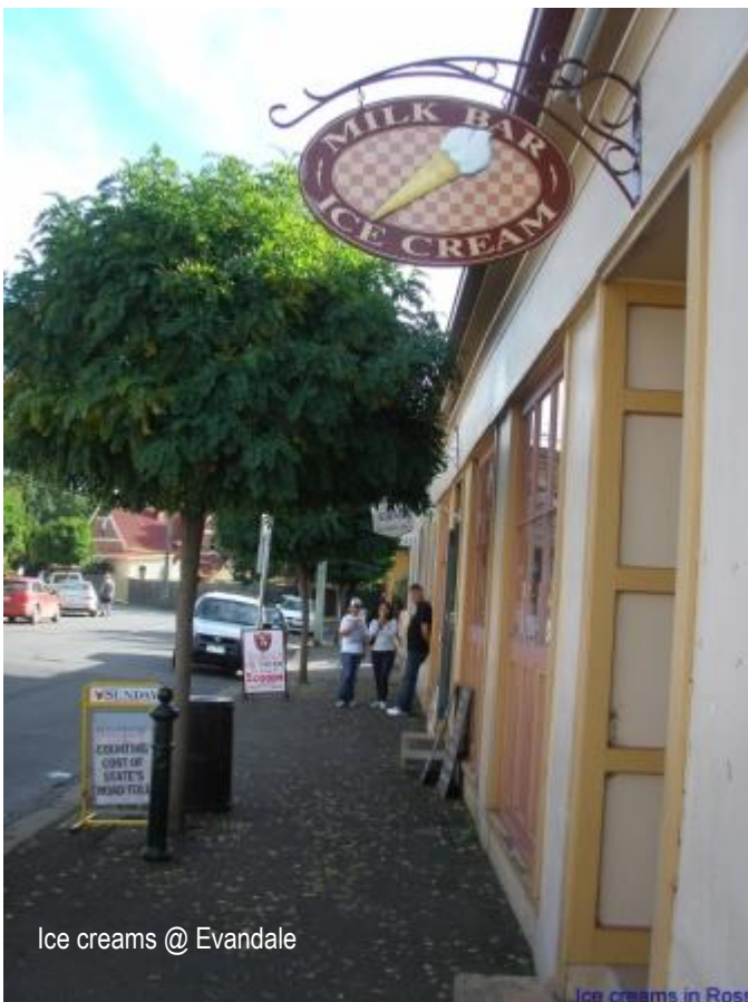
Ice creams @ Evandale

After lunch we then drove out on the highway passed the Symmons Plains Motor Race track onto Evandale for an ice cream stop and walk around then we left going past the Airport back to the cabins arriving at 2.50pm . The boys then got busy washing the cars again for the trip with the Jaguar Car Club of Tasmania on Sunday